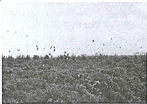
Picture 2. Bạc Liêu Bird Sanctuary

- Ecotourism natural resources: NR Bac Lieu bird sanctuary is blessed gift of tourism resources with the natural diversity of species, unique, particularly with many species listed in the Red Book.