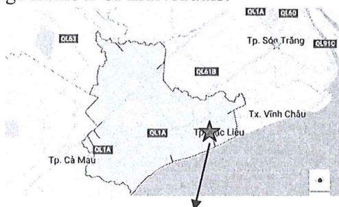
Picture 1. Location of Bird santuary

It concentrate here for resident, nesting and multiplying the species composition with huge number of individuals.